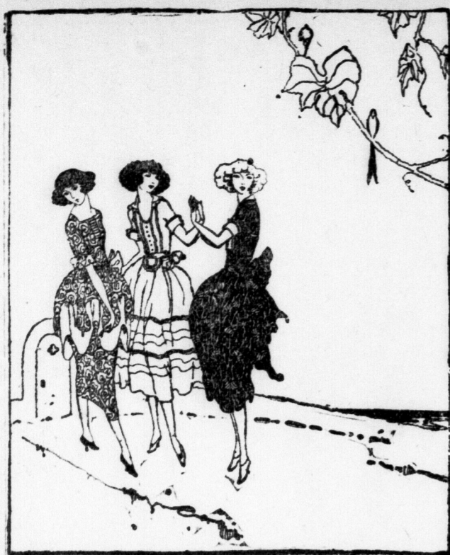
July Finds Everyone Needing Additional