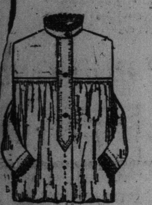
White Cotton Night Gown, with high collar, long sleeves, same as cut, 29

Above everything else we insist that you make comparisons. These plain, definite statements give you a good chance to compare.