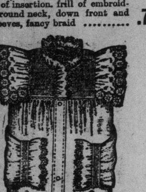
White Cotton Gown, 2 clusters of tucks, 2 rows of insertion, same as cut, 64