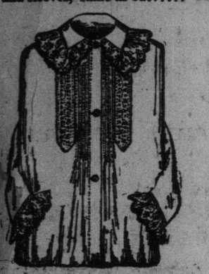
White Cotton Corset Cover, high collar, long sleeves, same as cut, 18