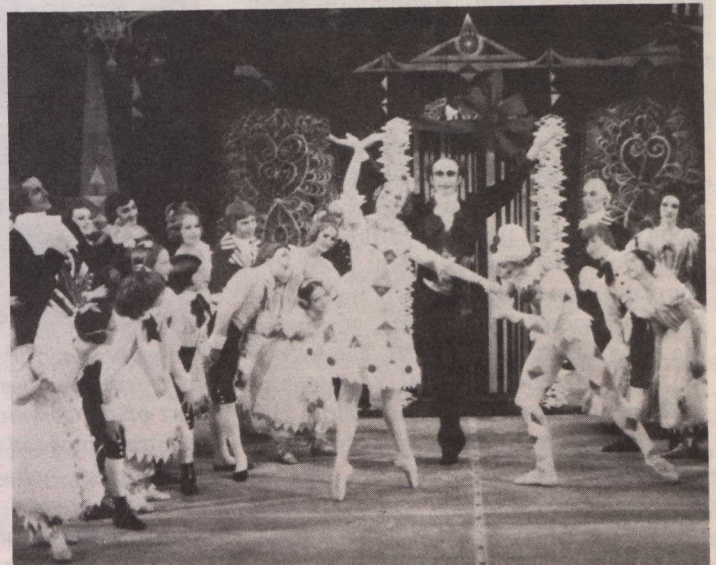
The Nutcracker, National Ballet of Canada.