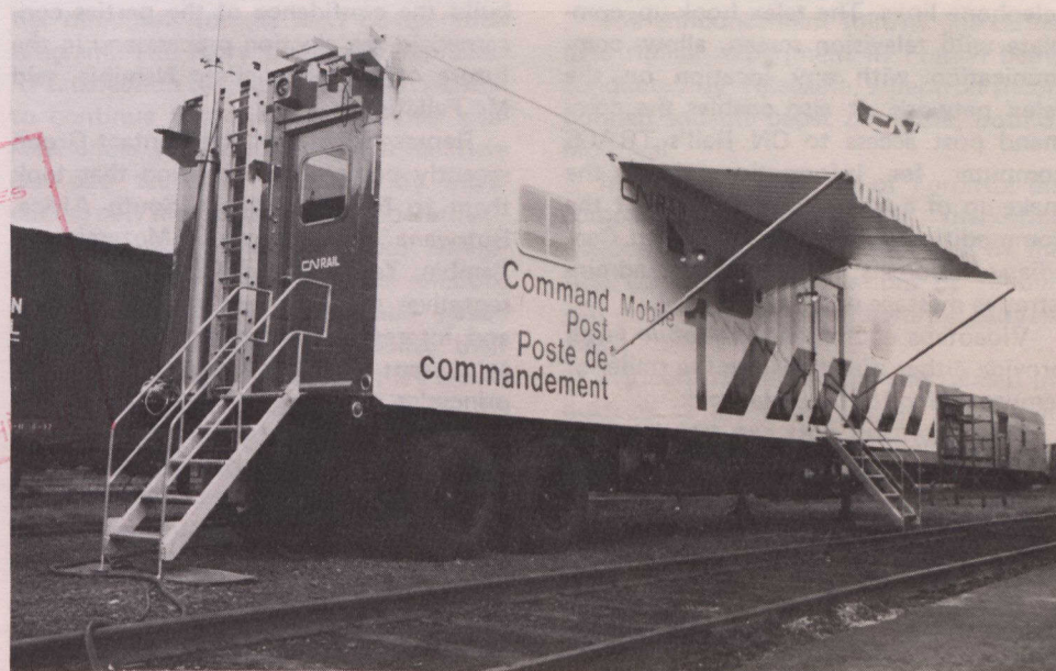
This special communications trailer was custom-built by CN Rail at a cost of some $250,000. Designed to be the Command Post at the site of a major derailment, Mobile 1 can travel by highway and rail flat-car.