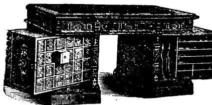
Rotary Desk, No. 50.

School, Office, Church & Lodge Furniture.