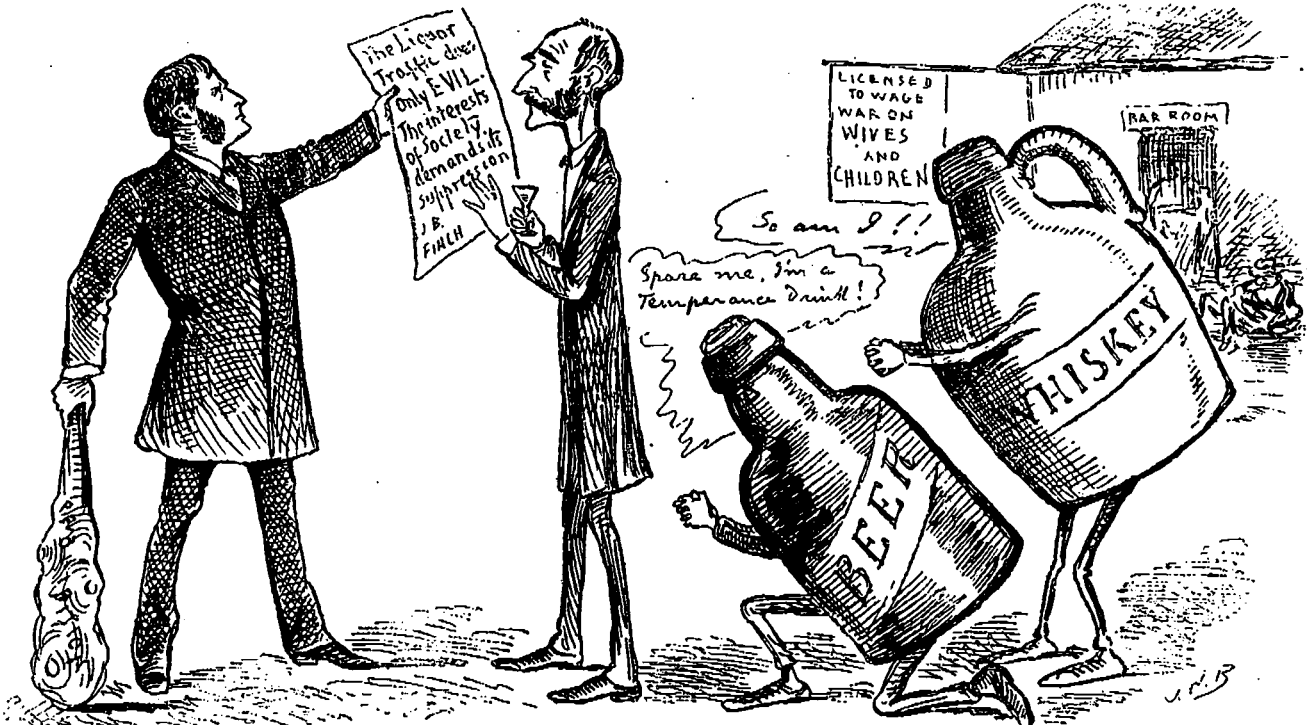
G.S.—PRAY, Mr. FINCH, DON'T BE SO MUCH IN EARNEST! IT'S VERY BAD FORM, YOU KNOW?

a thousand times no. Retract your cruel words or—we part!" Percival was dazed at the unexpected reply to his impassioned appeal to bolt with him. Curbing his temper he turned from her, walked a few paces and bowed his head, which afforded him an opportunity of taking a small awakener from a "pocket pistol" in his overcoat pocket, at the same time giving him a chance to recover his bewildered mind. Approaching her, he said: "Carry, I am sorry for this. I am sorry to see you puttin' on such airs. You used to take a glass of wine easy enough at Dick Well's when we druv out there. Perhaps the Varsity has raised you above your shoulders. You say you are a Freshwoman. I believe it—you are altogether too fresh for me, good-bye!" and leaping lightly over the fence he was gone. "He will live to rue this," was all that Carry said, as wiping her eyes on a bunch of crevel-work, she sadly walked homeward. "He will live to rue this." Well did she keep her word.