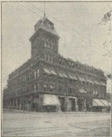
THE COLLEGE BUILDING