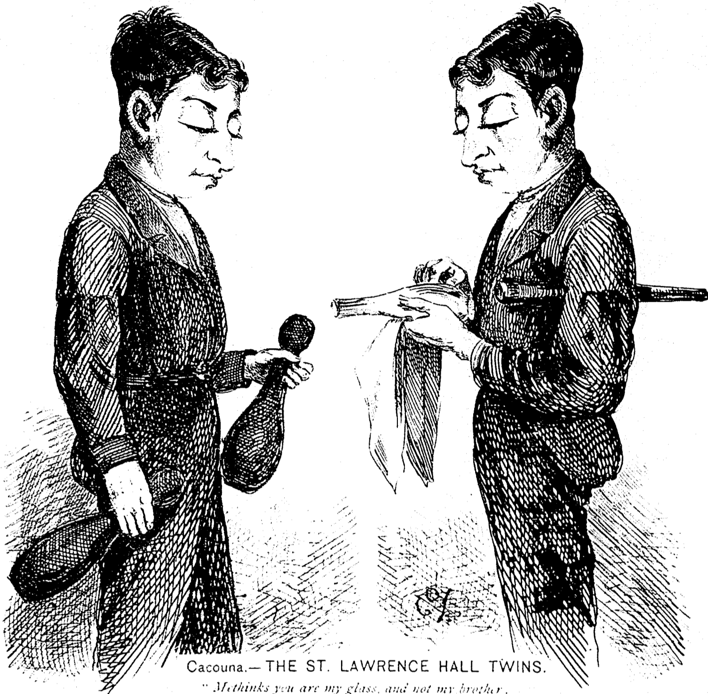
Cacoua.—THE ST. LAWRENCE HALL TWINS.

"Methinks you are my glass, and not my brother. I see by you I am a sweet-faced youth."