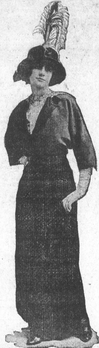
COSTUME FOR EARLY SPRING.

There is going to be a new vogue for batiste embroideries on an ecru ground. Various widths of these are to be