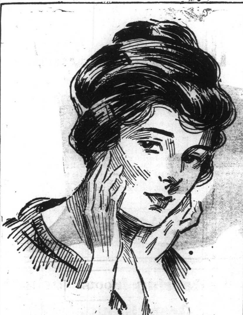
OILY SKINS— How to correct them

Do not expect to change in a week a condition resulting from long neglect. But use this treatment persistently, and it will gradually reduce the enlarged pores until they are inconspicuous.