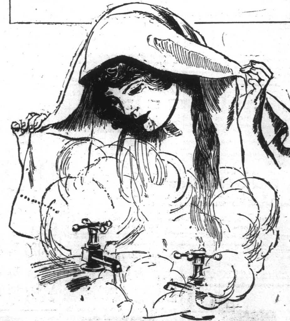
PALE, SALLOW SKINS— The new steam treatment for them

This treatment will make your skin fresher and clearer the first time you use it. Make it a nightly habit, and before long you will see a marked improvement—a promise of that lovelier complexion which the steady use of Woodbury's always brings.