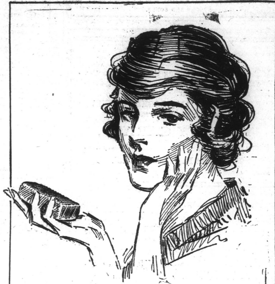
SKIN BLEMISHES— How to get rid of them

Woodbury's Facial Soap is on sale at all drug stores and toilet goods counters in the United States and Canada. The famous booklet of treatments is wrapped around each cake. Get a cake today and begin your treatment tonight. A 25-cent cake lasts for a month or six weeks of any treatment or for general cleansing.