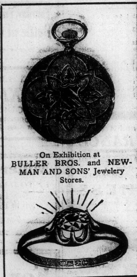
On Exhibition at BULLER BROS. and NEW- MAN AND SONS' Jewelry Stores.

Great Vote Offer Ends Saturday Night, 8 O'clock