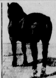
Gaston the Needle Breaker No. 533, Imported 4 year-old Belgian, weighing 2100 lbs.