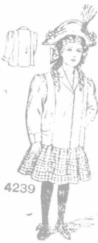
4239—Girl's Coat, 3 sizes, 1 to 12 years.