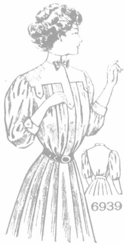
6939—Ladies' Shirtwaist, 6 Sizes, 32 to 42 inches bust measure.

N.B.—Order by number and send 10 cents for each pattern to "Fashion Department, Farmer's Advocate, Winnipeg, Man."