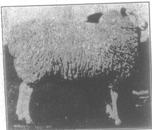
A Leicester Champion of 1913.