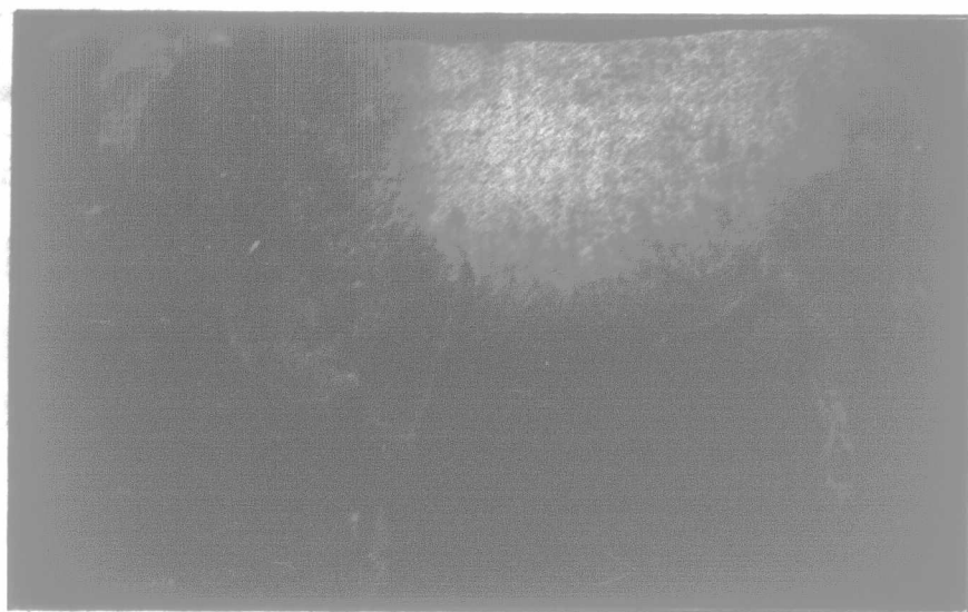
Water Cross (Imp.) = 38181 =.

Bowmanville Station is on the main line of the G. T. R. (40 miles east of Toronto); 5 trains each way daily.