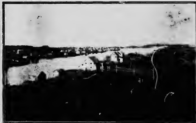
Change Islands. Steamer passes through this run.