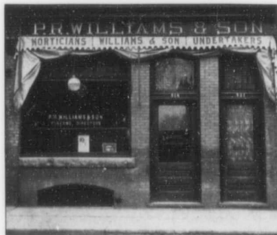
P. H. Williams' Offices, 510 Talbot street