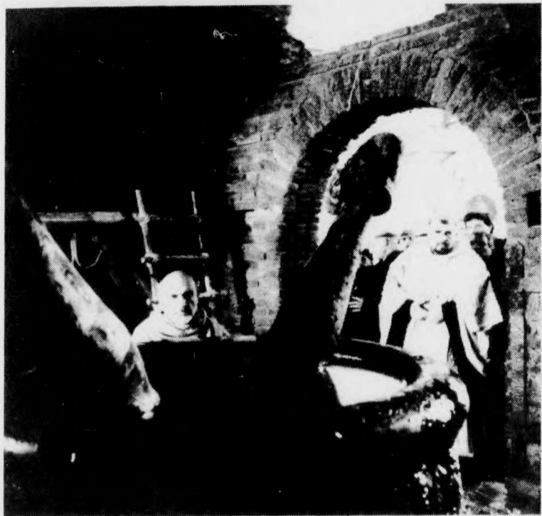
WHAT A WAY TO GO: The eternally stone-faced Sean Connery is watched by "a fine bunch of misdirected libidos" who are the backbone of The Name of the Rose .