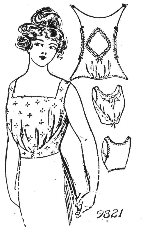
9821. A new corset cover. Ladies' one piece corset cover, in round, square or "V" neck edge.

A pattern of this illustration mailed to any address on receipt of 10c. in silver or stamps.