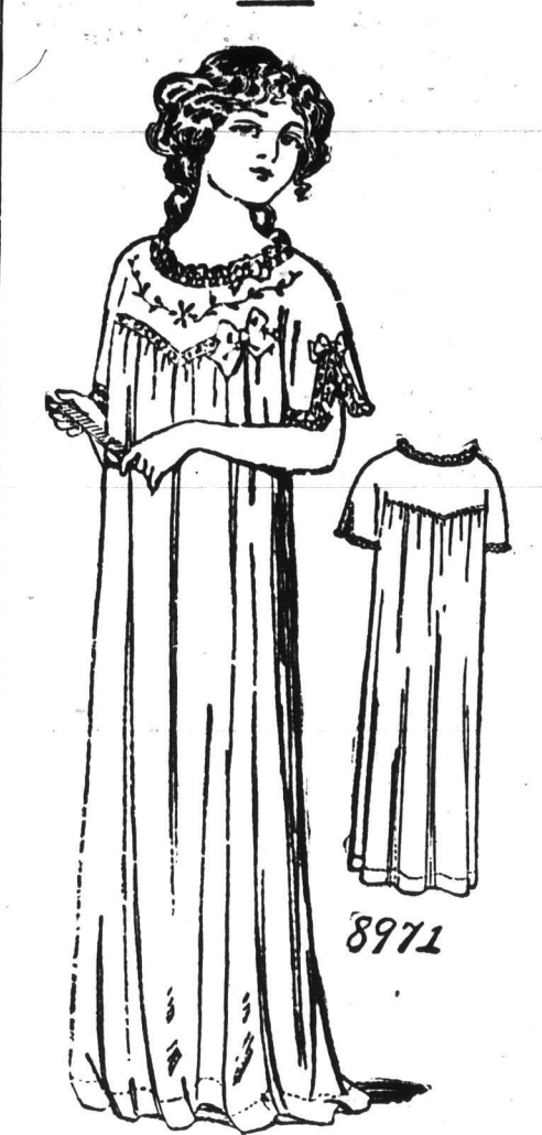
8971. A unique and effective night gown. Ladies' night dress with peasant yoke.

cut in four sizes: 14, 16, 17 and 18 years. It requires 4½ yards of 44-inch material for a 16 year size. A pattern of this illustration mailed to any address on receipt of 10c. in silver or stamps.