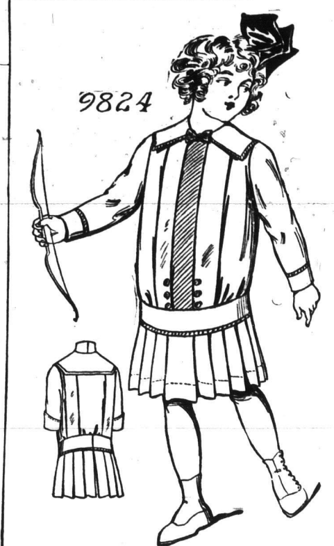
9824. A good style for the "new frock." Girl's dress, with or without chemisette, and with long or shorter sleeve.

A serviceable school dress of dark olive green cheviot, with trimming of red eponge, could be developed from this design, or for more dressy wear black velvet would be effective, with trimming of light blue or white faille. The design is closed at the side under the plait. It is also appropriate for serge, galatea, corduroy, gingham, or percale. The pattern is cut in four sizes: 4, 6, 8 and 10 years. It requires 4 yards of 40-inch material for a 10 year size.