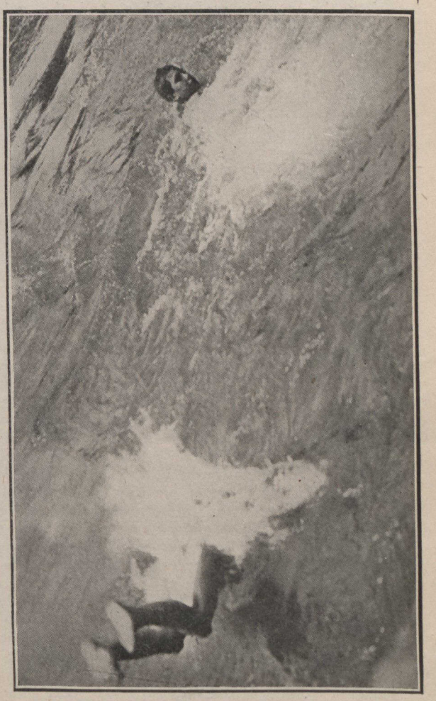
These Boys Took an Adventurous Way of Keeping Cool by Swimming in the Niagara River.