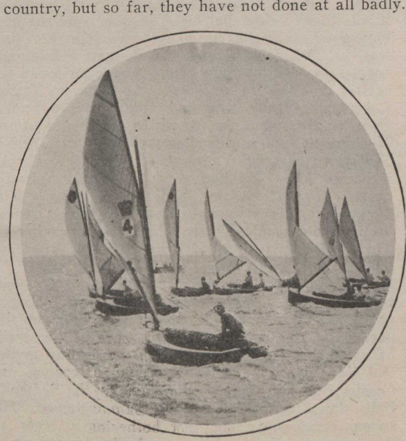
An Effective Line-up of Dinghies.

making a much better showing since they got accustomed to the fast English greens. It looks now as if they might return with an equal number of victories and defeats to their credit. If this is the result, everybody will be satisfied. They, doubtless, find conditions somewhat different in the old country, but so far they have not done at all hedly country, but so far, they have not done at all badly.