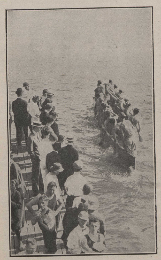
A War Canoe Scene in the Dominion Day Regatta at