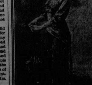
Dark blue satin gown and drapery. Jacket and cuffs and vest of black embroidered with Oriental colors.—Maison Jenny.