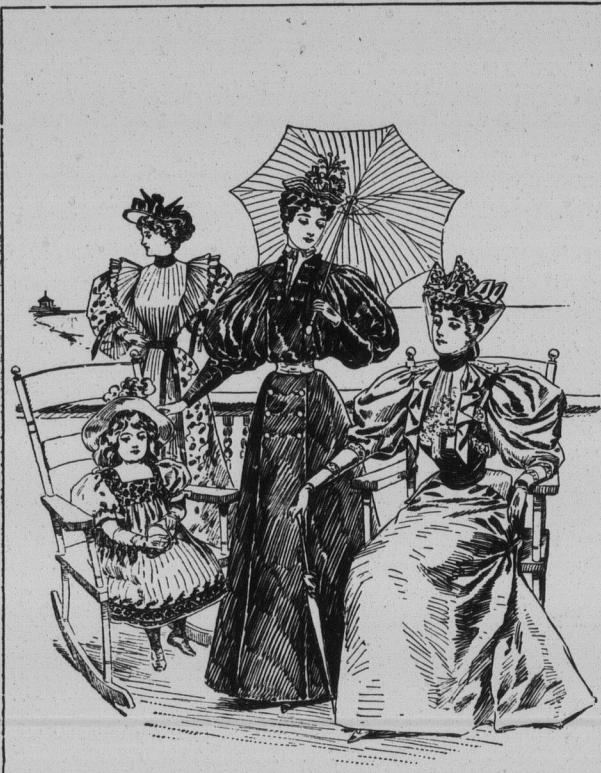
OUTING GOWNS FOR EARLY FALL.

Perhaps the day may come when some unknown dramatic author will suddenly leap from obscurity into eminence by exterminating the stage old maid and putting on the boards instead the bachelor woman