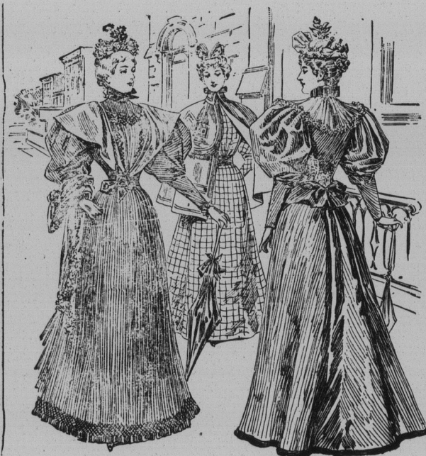
TOILETTES FOR ELDERLY AND YOUNGER LADIES.

The mere sound of the word "old maid" calls up a vision of its own, a vision of a pale thin woman with a sharp face and scant gray hair, worn in unbecoming ringlets, who affects black silk aprons and is addicted to black lace mittens, spectacles, and little prim looking reticules. We not only clothe her to suit our own imaginations, but we insist that she shall have a mincing walk, a prim mode of speech, and be eternally instilling prunes and prism maxims into the minds of the younger generation. Poor old maiden aunts of fiction and imagination, what caricatures they were,