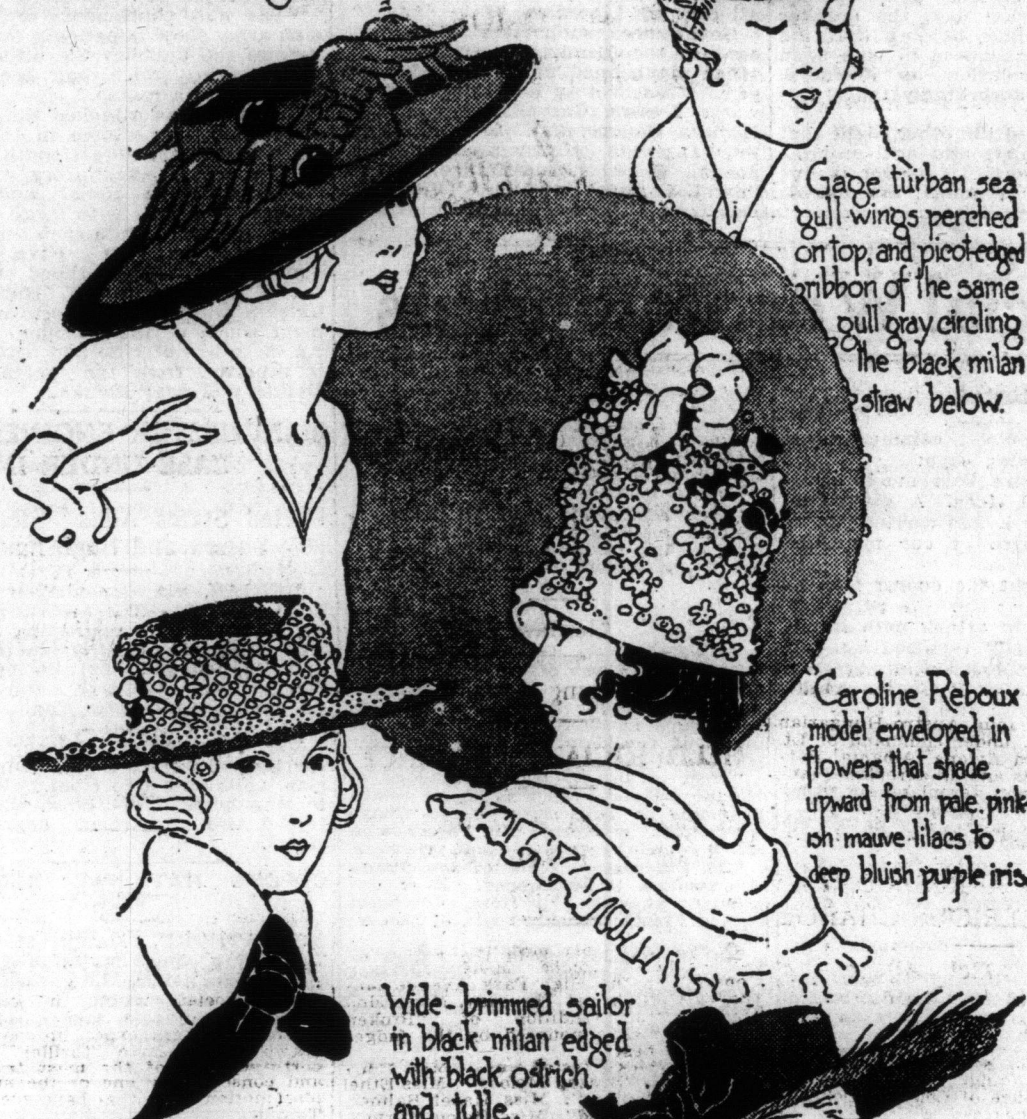
Gage turban, sea gull wings perched on top, and picotee edging of the same gull gray circling the black milan straw below.