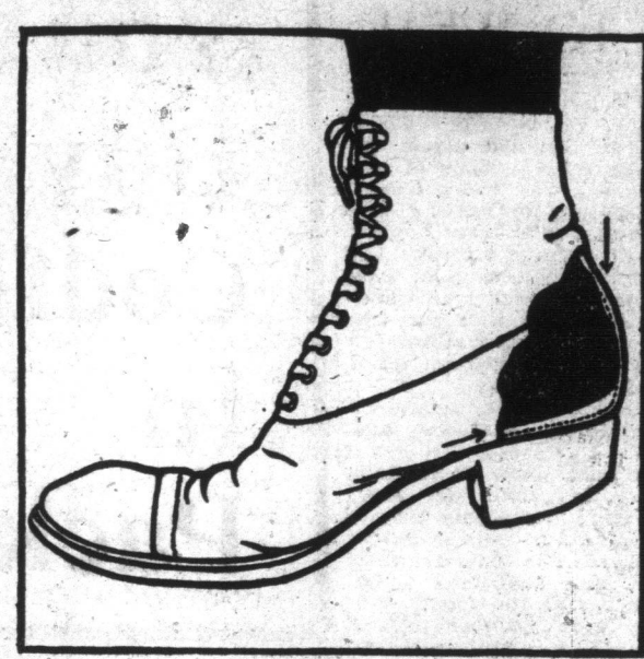
Action of a Heel-Skinning Counter