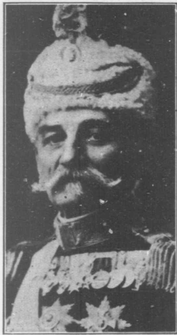
King Peter of Serbia.