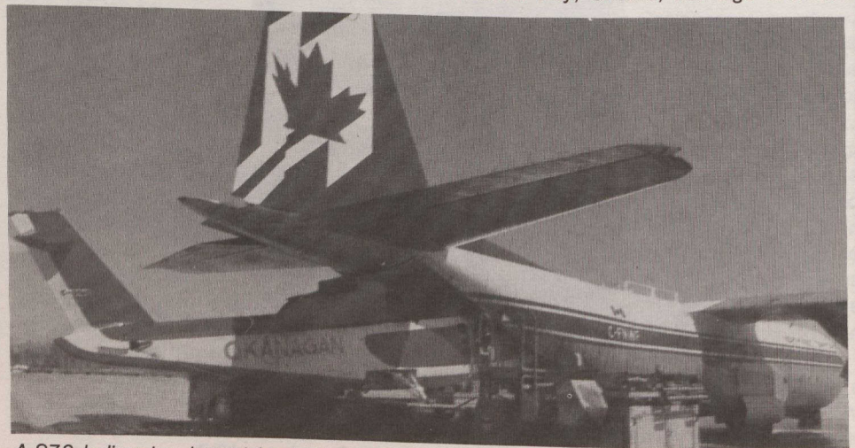
A S76 helicopter, bound for Australia, is boarded on a Hercules transport plane.

By 1981, a specially-outfitted Sikorsky S76, designated "Bandage 3", was sent into action on a permanent basis. Based in Thunder Bay, Ontario, Bandage 3 covers