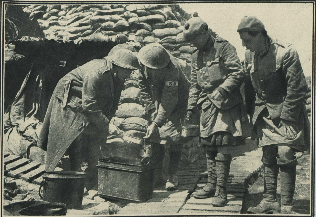
SERVING OUT A MEAL