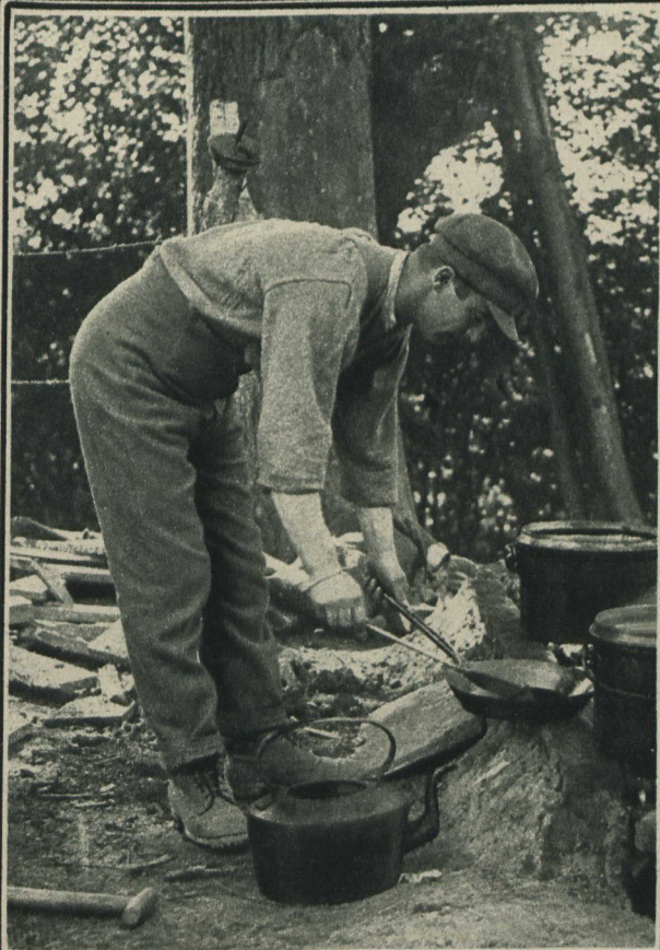
COOKING BEHIND THE LINES