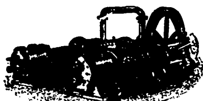
Duplex Compound Steam Air Compressor with Hal-ey's Mechanical Valves.

Of the Most Efficient and Economical Type—Straight Line, Duplex Compound, and Condensing