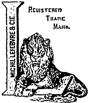
Lion "L" Brand.

... 20 First Prizes, Gold, Silver and Bronze Medals.