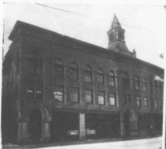
Burns Block, Calgary. Office of Sun Life of Canada for N.W.T.