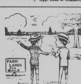
WE CAN SHOW YOU FARMS