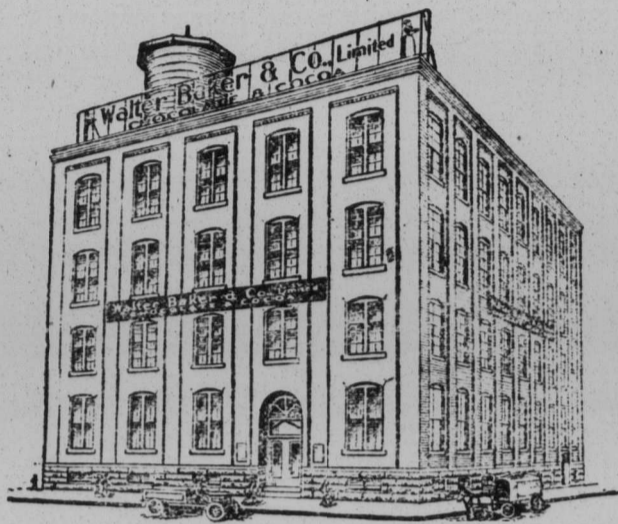
THE NEW MILL AT 1000 ALBERT STREET, MONTREAL

For over 131 years these well-known preparations have been made only at the company's mills (the largest in the world) at Dorchester, Mass., U. S. A. In order to keep pace with the rapidly increasing demand for its goods in the Dominion of Canada and the British Provinces, a large mill has been put in operation in Montreal.