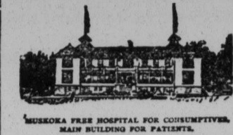
MUSKOKA FREE HOSPITAL FOR CONSUMPTIVES. MAIN BUILDING FOR PATIENTS.

A national institution that accepts patients from all parts of Canada. Here is one of hundreds of letters being received daily:—