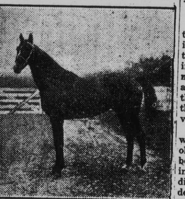
Thoroughbred Stallion "Anmer."

As an encouragement to breeders the Thoroughbred Horse Society has decided to distribute the revenues obtained from "Anmer's" stud fees in premiums at Agricultural Shows to classes of horses sired by a thoroughbred, which are best suited for remount and cavalry purposes.