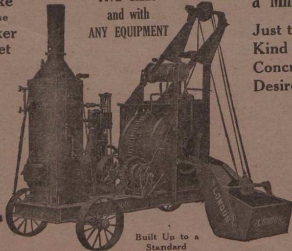
Built Up to a Standard

MADE IN CANADA from the best material and designs that money, brains and modern equipment can produce.