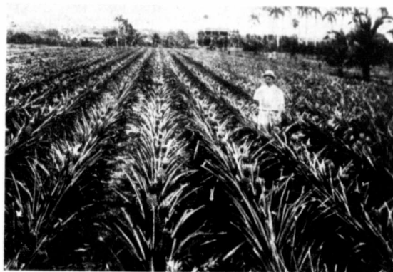
Crop of World's Best Pine Apples—Isle of Pines

Over Birks', cor. Portage and Smith Winnipeg, Man.