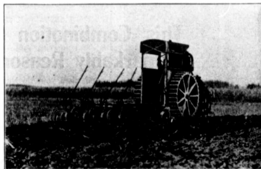
Doing a deep, even job of stubble plowing with a Hart-Parr "27" and 4 furrow self and hand lift plow.