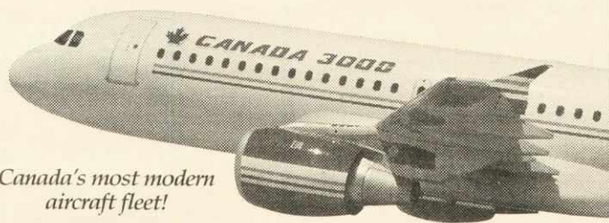
Canada's most modern aircraft fleet!