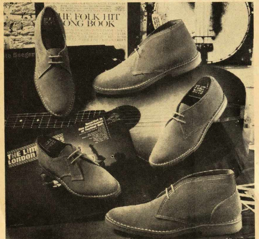
Here are the Village Look PLAYBOYS. All suede. Putty beige. Grey. Faded blue. All styles available in "His" - $9.95. "Hers" - $7.95. ($1 higher west of Winnipeg)

From the SPRING GARDEN BARBER SHOP Just a two minute walk from Dal and Kings on the way downtown SPRING GARDEN BARBER SHOP 5853 SPRING GARDEN ROAD at the corner of Spring Garden Rd. & Summer St.