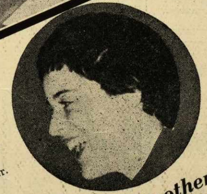
And Another Big Wheel