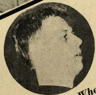
One Big Wheel