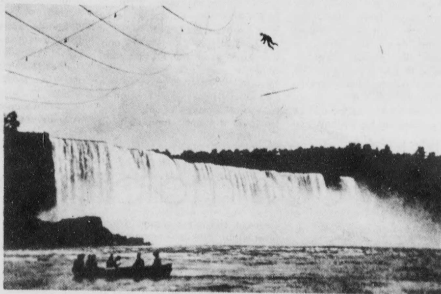
BELLINI'S COUCHANE LEAP—1873