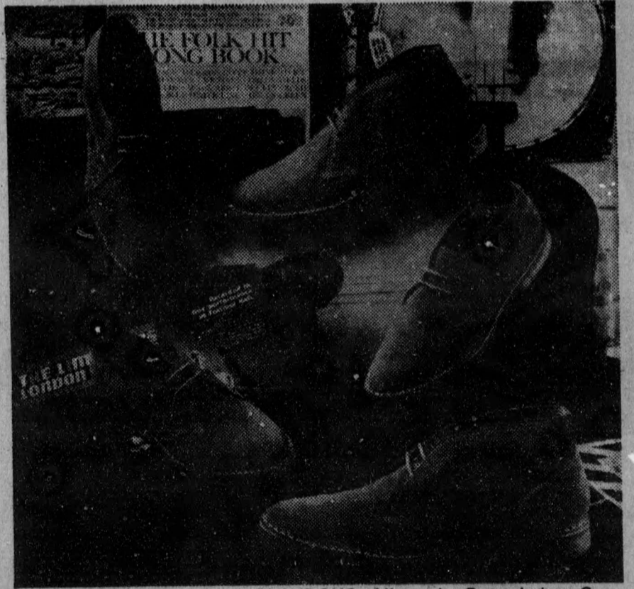
Here are the Village Look PLAYBOYS. All suede. Putty beige. Grey. Faded blue. All styles available in "His" — $9.95. "Hers" — $7.95. ($1 higher west of Winnipeg)

"I think on the whole movies are rather poor stuff. One might easily issue a list of movie stars who could be offered up for an anatomical experimentation and no one would be any the sadder. This ought to canonize and idealize the Marx Brothers and Eddie Cantor. I am highly in favour of price reduction. Movies are a money making proposition and not prompted by any altruistic motives.