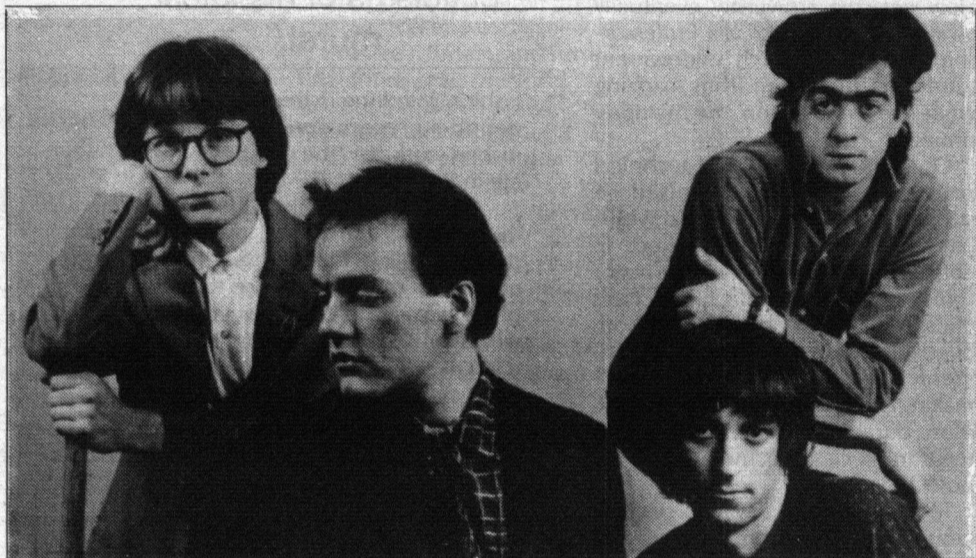
All their obscure singles but no smile for the camera

P.S. — Watch this space in the near future for a review of the new R.E.M. studio LP Document .