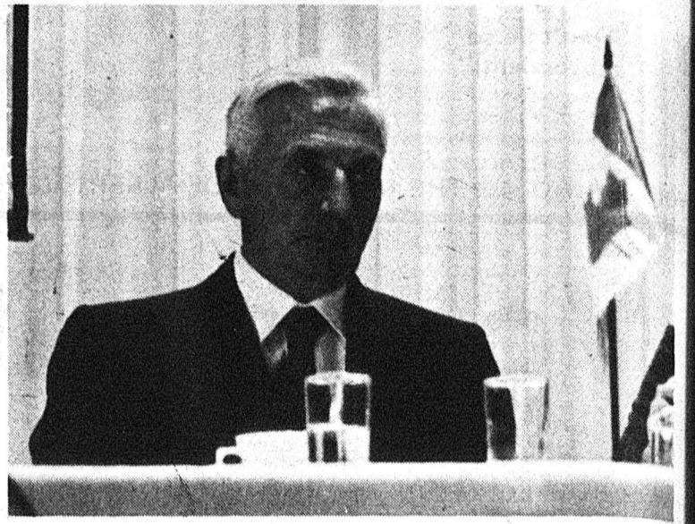
Judd Buchanan, Minister of Indian and Northern Affairs.

Buchanan cited the Supreme Court's 1973 ruling of the Nishga land claim as bringing about a major change in the government's policy to "formal-