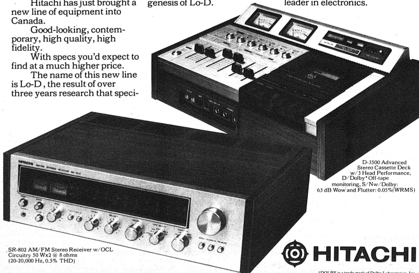
SR-802 AM/FM Stereo Receiver w/OCL Circuitry 50 Wx2 @ 8 ohms (20-20,000 Hz, 0.5% THD)

The kind of achievement that has made Hitachi a world leader in electronics.