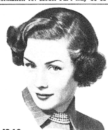
1946: HOW LUCKY SHE IS. SHE HAS CURLY HAIR!

The Inter-Party Committee will meet Monday in the planning commission room of SUB at 1 p.m. All six parties which have been accepted to run in Model Parliament must have two representatives and at the meeting. In sentatives each at the meeting. In-formation re: Model Par'l may be ob-