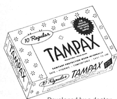
Developed by a doctornow used by millions of women

Tampax tampons are available in three absorbency sizes (Regular, Super and Junior) wherever such products are sold.