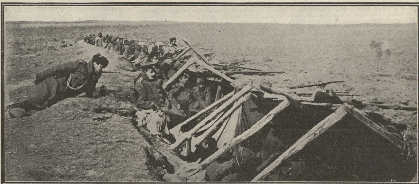
Bulgarians Resting in the Trenches, Kartal Tope, During the Bombardment of Adrianople. The Clothing of the Men Indicates That the Weather Was Pretty Severe.

For of Course We Are Too Busy to Defend Ourselves