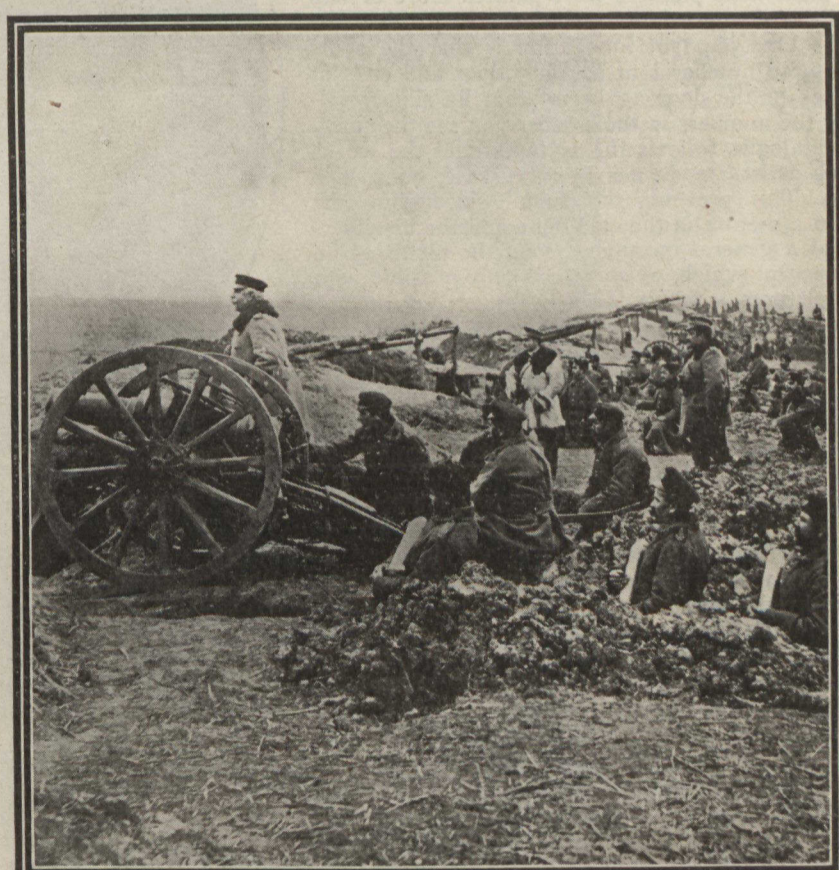
The Smaller Siege Guns Entrenched Around Adrianople. Note the Soldiers Carrying the Shells and the Officers Watching for Signals.