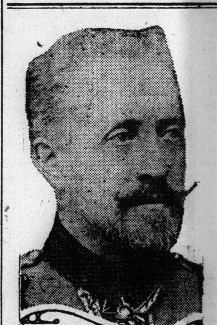
Grand Duke Nikolai Nikolayevich

The Commander of the Russian Caucasian Army, who have been winning Victories over the Turks.