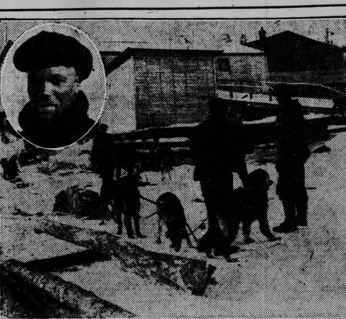
Hudson, the jumping-off place for the new gold mining district around Red Lake. The picture shows a party about to leave for Red Lake, and, inset, a picture of a typical prospector searching for gold.

BEST HARDWOOD, any length, $11.00 Truck load—W. P. Turner, 1500 St. John St. Extension, Phone 6714