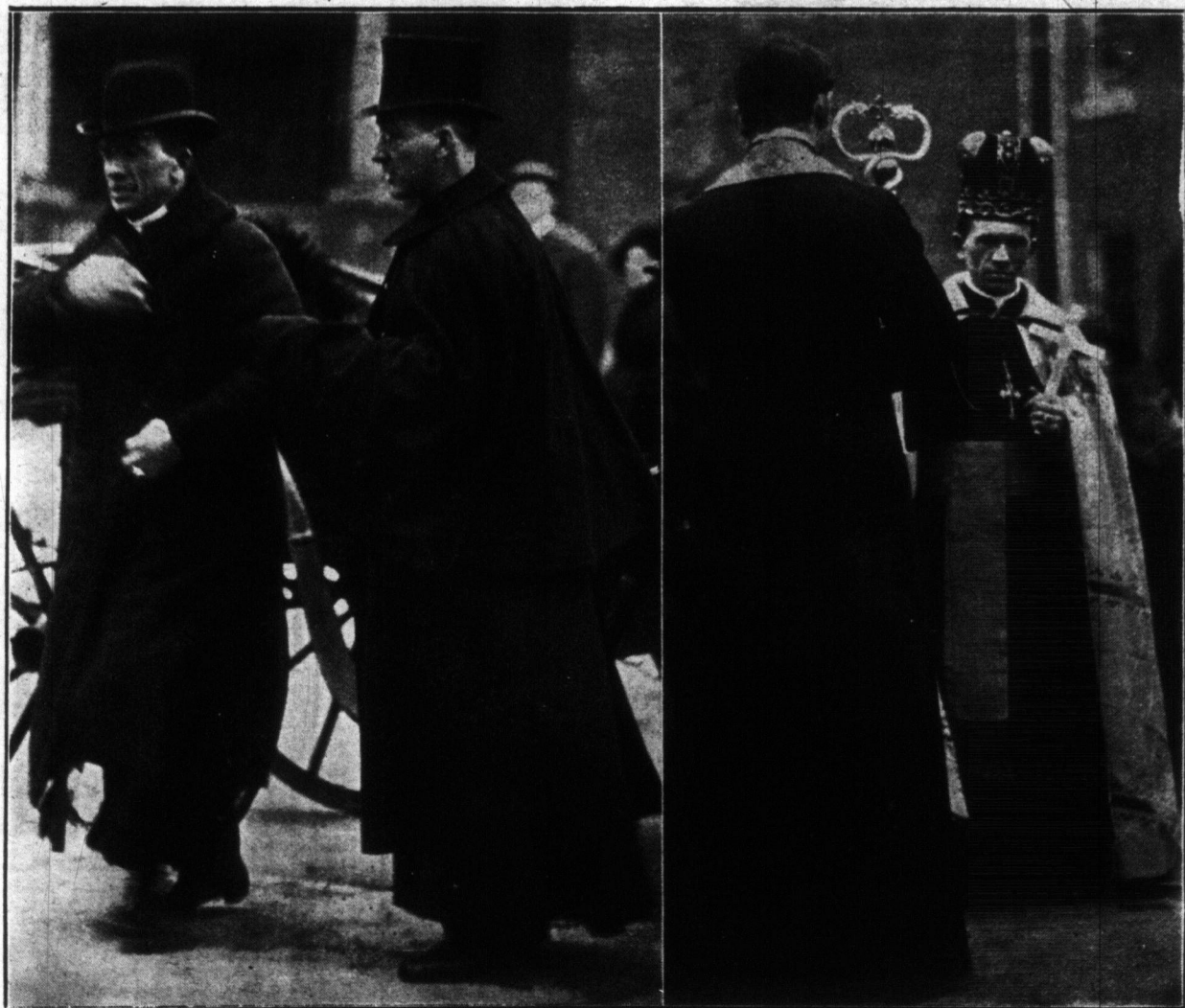
ARRIVAL OF NEW RUTHENIAN ROMAN CATHOLIC BISHOP. ON THE LEFT HE IS IN HIS STREET CLOTHES. ON THE RIGHT HE IS IN HIS ROBES OF OFFICE.