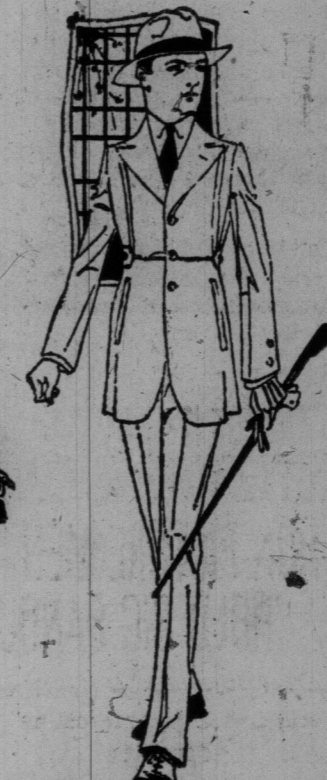
This is the "Oakwood" Model---A Youth's First Longer Suit---of EATON Make

So suitable, and so much favored by those with a young figure. It's of all-wool tweed, in either a chocolate brown, camel hair effect, or in plain Cuban brown, in the two-button, single-breasted style, with long, soft roll lapels and slash pockets. Straight cut trousers, with cuffs. Sizes 34 to 39. Price, $23.00.