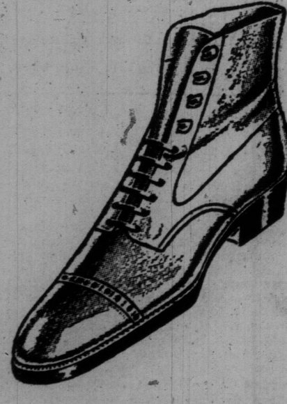
No. 8 is a boot of vic kid (Edwin Clapp brand), with an inviolable cork insole, which assures lightness and foot comfort. Widths A to E. Sizes 5½ to 11. Price, $15.00.