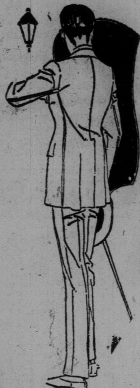
A Young Man's Suit of Union Tweed, With Smart Appealing Lines and a Splendid Value

Other suits of better quality union and all-wool worsted may be obtained at $35.00, $40.00, $42.50 and $55.00.