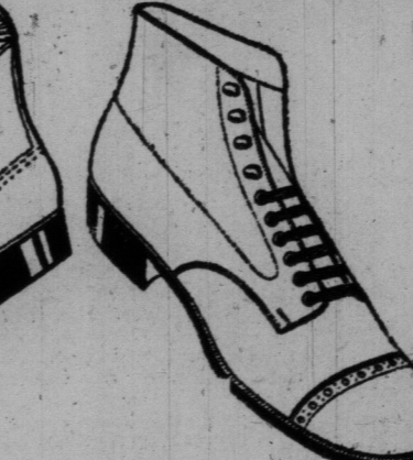
No. 6 is another "Educator" boot—a favorite with those who have weak arches—because it has a steel arch and a long counter. It's of fine kid and in widths A to EE. Sizes 5½ to 11. Price, $12.00.