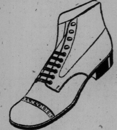
No. 3 is a Packard orthopedic boot, which allows a broad, roomy fit at the ball of the foot. Has a flexible arch, and is of fine kangaroo. Sizes 5½ to 11. Widths C, D, E. Price, $12.00.