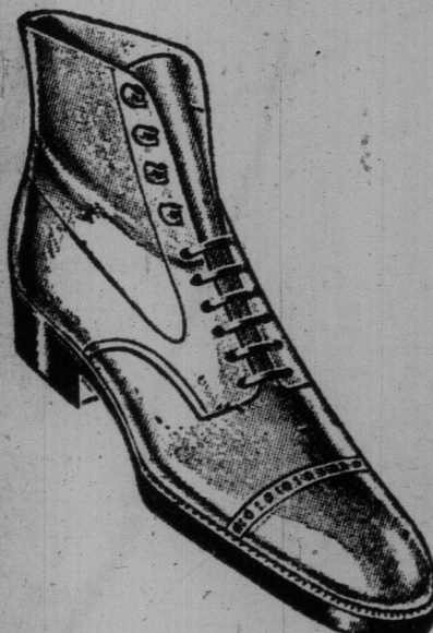
No. 1 is a Packard boot, of kangaroo, on a combination last—the ideal boot for those who desire a broad fit in the toe and a snug fit at the heel. Widths A to E. Sizes 5½ to 11. Price, $12.00.

The Men Who Fit These Boots Have Had Long Experience, and Use Thoughtful Care Along With Scientific Principles