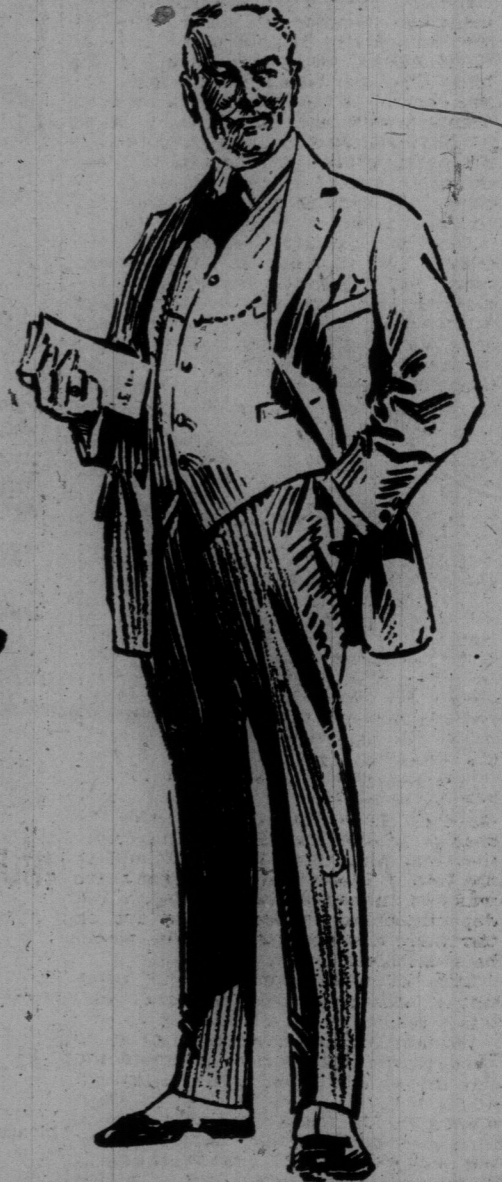
A Suit for the Short, Regular-sized Man is Priced at $30.00

It's in the two-button, single-breasted split coat or waisted style, with half-belt stitched on back, which shows a button at each side, has slash body pockets, deep vent at back to waistline, and is of a firmly finished union worsted in black and white pin check. Price, $25.00. The same model, of all-wool cassimere finished tweed, in medium grey, showing a black pencil stripe, is priced at $30.00.