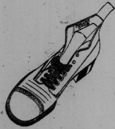
No. 2 is the "Educator" boot—a boot of fine kid, known the country over for its splendid fitting quality, and ability to give the wear. As you can see by the illustration, it's in a wide, roomy last. Widths A to EE. Sizes 5½ to 11. Price, $13.00.