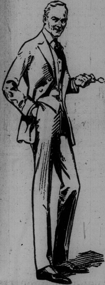
For Either the Tall "Regular" or Tall Stout Man

Have Been Studied, and Prepared for, by the Different Men's Wear Sections