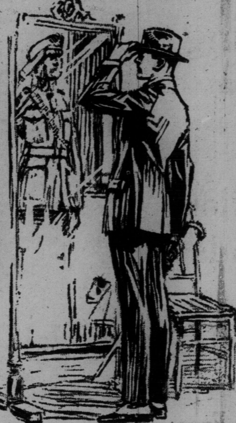
Suits for the Man Who is Bidding Khaki 'Good-bye' Are in Grand Array

A top coat in fine weather, a reliable rain-proof in wet weather. It's of cotton and wool tweeds and firmly-finished cotton worsteds, in either full-fitting, slip-on or in all around better styles. Has patch pockets with flaps, wind strap on cuffs. Fancy overcheck linings; stitched, cemented and taped seams and convertible collars. Sizes 34 to 44. Price, $13.75.