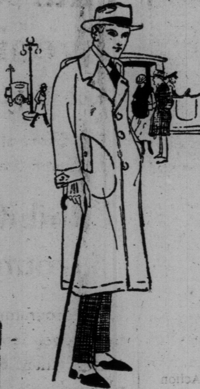
A Gabardine Shower-proof of the Famous "Burberry Make"

One of the most popular suits is proving to be the blue serge. Such a suit of all-wool, soft finished botany yarns, the old-time quality and weight, tailored in the single-breasted, two-button, form and semi-form-fitting styles, and with natural shoulders, soft roll peak lapels, is in two qualities, one at $37.50, the other at $45.00. Sizes 34 to 44.