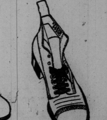
No. 7 is also of the "Educator" brand, and in fine chocolate kid. Has the wide toe and roomy fit so typical of the "Educator" boot. Widths A to EE. Sizes 5½ to 11. Price, $12.00.