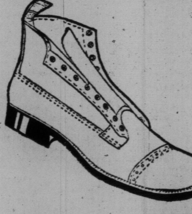
No. 4 is a dongola kid "cushion sole" boot, with layer of felt over insole, which gives it its name. It's a boot of solid comfort for those with tender feet. Widths A to E. Sizes 5½ to 11. Price, $8.00.