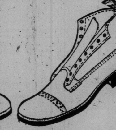
No. 5 is a boot of vic kid on a broad, roomy last, and with orthopedic toe. Widths A to E. Sizes 5½ to 11. Price, $11.50.