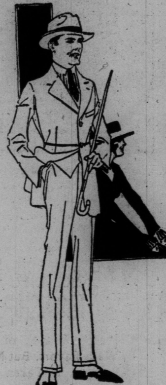
This is the "Split" Coat or Waisted Model

In the single-breasted, full-fitting style, with convertible collar, raglan shoulders, slash pockets, windshield in cuff, quarter lining and deep vent at back—a coat of splendid quality and in appealing style, as you can see by the illustration. — Sizes 36 to 44. Price, $32.50.