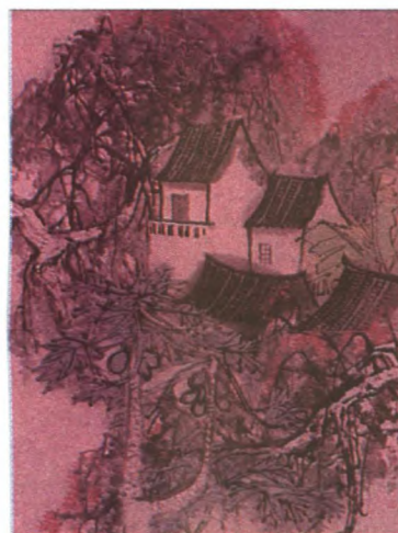
Masterpieces of 20th Century Chinese Painting: an exhibition coming to Canada this year

For information on the APEC SME Business Forum and Exposition contact The GLOBE Foundation: Tel.: (604) 775-7265 Toll Free: 1-800-952-3493 e-mail: appecinfo@globe.apfnet.org